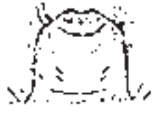
Asiatic garden beetle