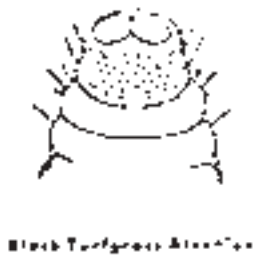
Black Turfgrass Ateletus