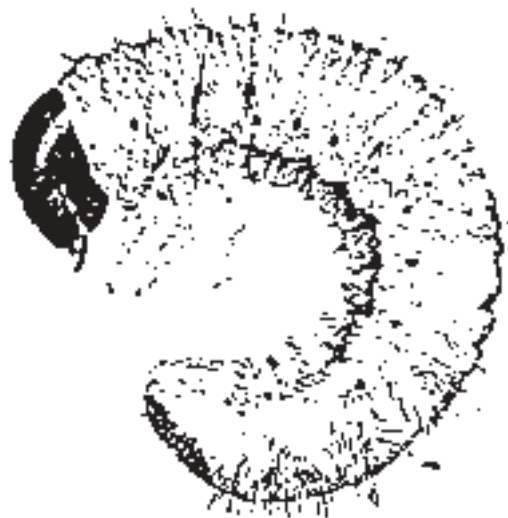
Fig. 1 Typical white grub